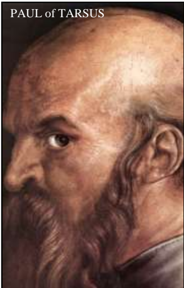
PAUL of TARSUS

Early Christian ideas to develop include the Trinity (God, Jesus, Holy Spirit), and the tying of Classical philosophy to Christian beliefs. Also, Monasticism developed under Benedict in Italy with peasants he converted from the worship of Apollo. SYNCRETISM : Christmas=Roman Winter Solstice Holiday. Churches built using Roman architectural styles.